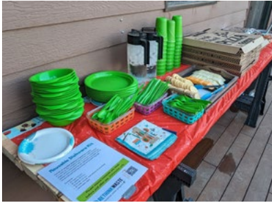
"It worked perfectly for us," they said, for their child's birthday party.

Since last fall, our free reusable dishware program has reduced over 2,000 units of single use waste! Community members borrowed dishware kits for over 40 low-waste gatherings, including lively birthday parties to relaxing picnics, productive staff trainings, and heartwarming family reunions.