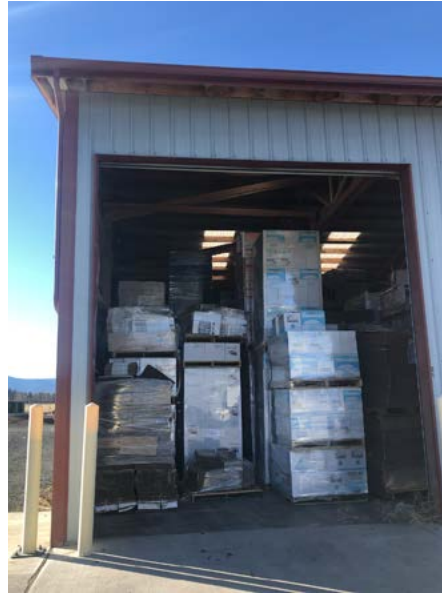
The initial walkthrough at Crater Lake Spirits revealed the amount of plastic film they deal with.

We got to work on a pilot project to identify a pathway for plastic film recycling and test collection and delivery processes. In the second half of 2022, beverage manufacturers— Deschutes Brewery, Crater Lake Spirits, Sunriver Brewing, Worthy Brewing, and Crux Fermentation Project— worked together to divert 4,480 pounds of plastic film from Knott Landfill in just two test deliveries. Baled plastic was loaded onto trucks already headed to Portland (huge shoutout to Deschutes Brewery for taking the lead on storing, bailing, and delivering!) Bales are delivered to Far West Recycling where film is aggregated and sent to be recycled as content for plastic bags.