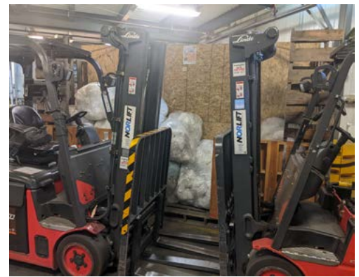
Plastic film gets baled and stored at Deschutes Brewery.

In late 2021, Crater Lake Spirits and The Environmental Center's Rethink Waste Project convened a Plastic Film Focus Group inviting local businesses looking to reduce and recycle plastic film in their businesses. Most of the participants were beverage manufacturers that pointed out that a significant amount of the plastic film they were disposing of came from products they received, and the quantity of plastic film they do utilize is used to secure products on pallets to ensure worker and product safety.