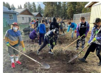
Students at Sisters Elementary School work in their garden, which received funding in 2021.