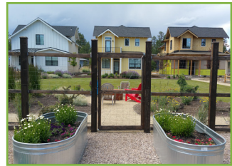
Featured home in 2019.

2020 is a year of milestones for the Green Tour. This year marks the 20th Annual Green Tour in Central Oregon and it's also the first ever virtual tour!