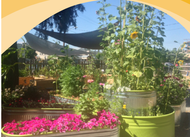
Garden space at The Environmental Center

Remember to contact us the next time you need affordable and flexible meeting space in Central Oregon!